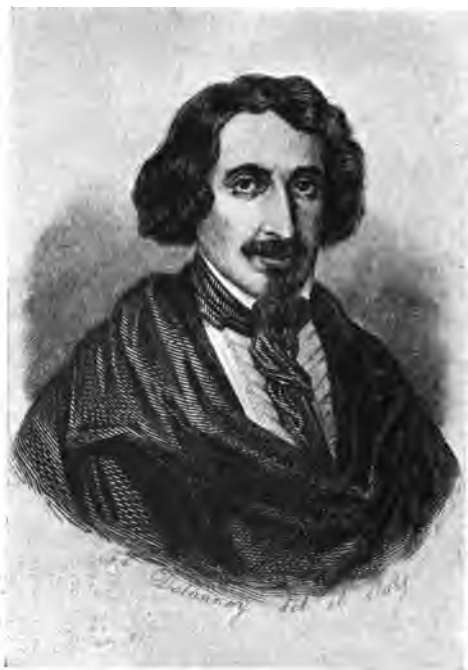
José de Espronceda